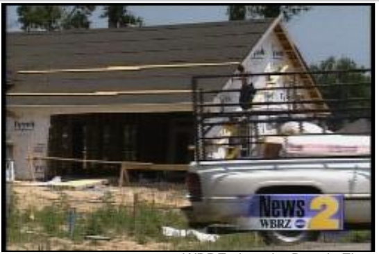
Ascension Parish will consider adding fees to new construction during a council meeting Thursday night.

The fees only need the approval of of the parish council, while a sales tax hike would have to go before registered voters.