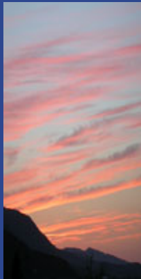
Scenic Shots of Eastern Idaho