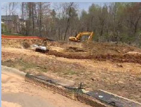
Video: Raleigh Officials, Homebuilders Debate Proposed Impact Fee Increases