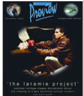
Arts & Entertainment Magazine