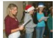
Noblesville Choir at R Noblesville High School gir