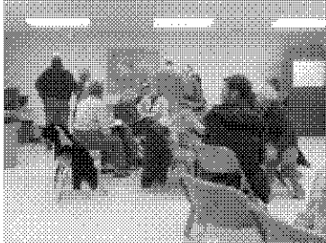
Voters decided to throw out the county's growth guidelines