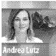
Reporting from KPAX in Missoula

The way to handle growth took center stage in the Bitterroot on Election day as residents decided to repeal Ravalli County Growth Policy.